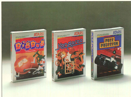
These prototypes illustrate Atari's eye-catching new arcade packaging.

This new high-tech controller is easy to use and features the familiar ATARI Joystick design. The remote control antenna is safety covered with flexible plastic. Each set includes two joysticks and a receiver.