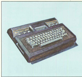
The Atari 2600 keyboard will be shipped to retail outlets nationwide by the 3rd quarter 1983.

Soon we'll introduce PRO-LINE TRAK-BALL™ controllers for both the 2600 and 5200 game systems, along with the 2600 PRO-LINE JOYSTICK.