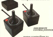
2600 REMOTE CONTROL JOYSTICK

The ATARI PRO-LINE advanced controllers offer a complete selection of