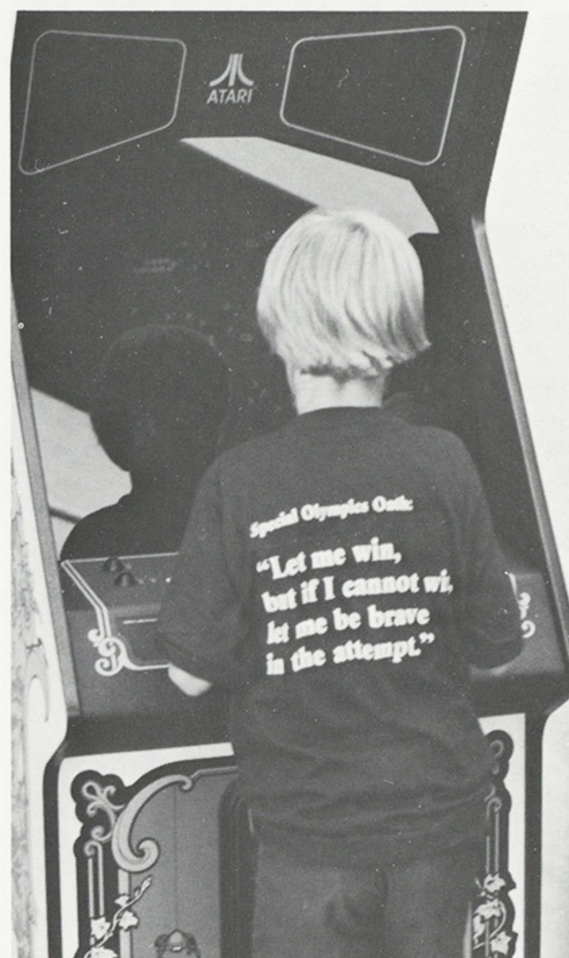
University of California at Berkeley June 24-26, 1983