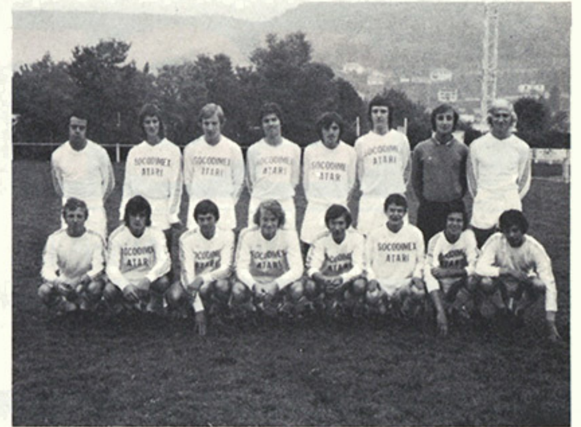
Socodimex/Atari-Europe Soccer Team