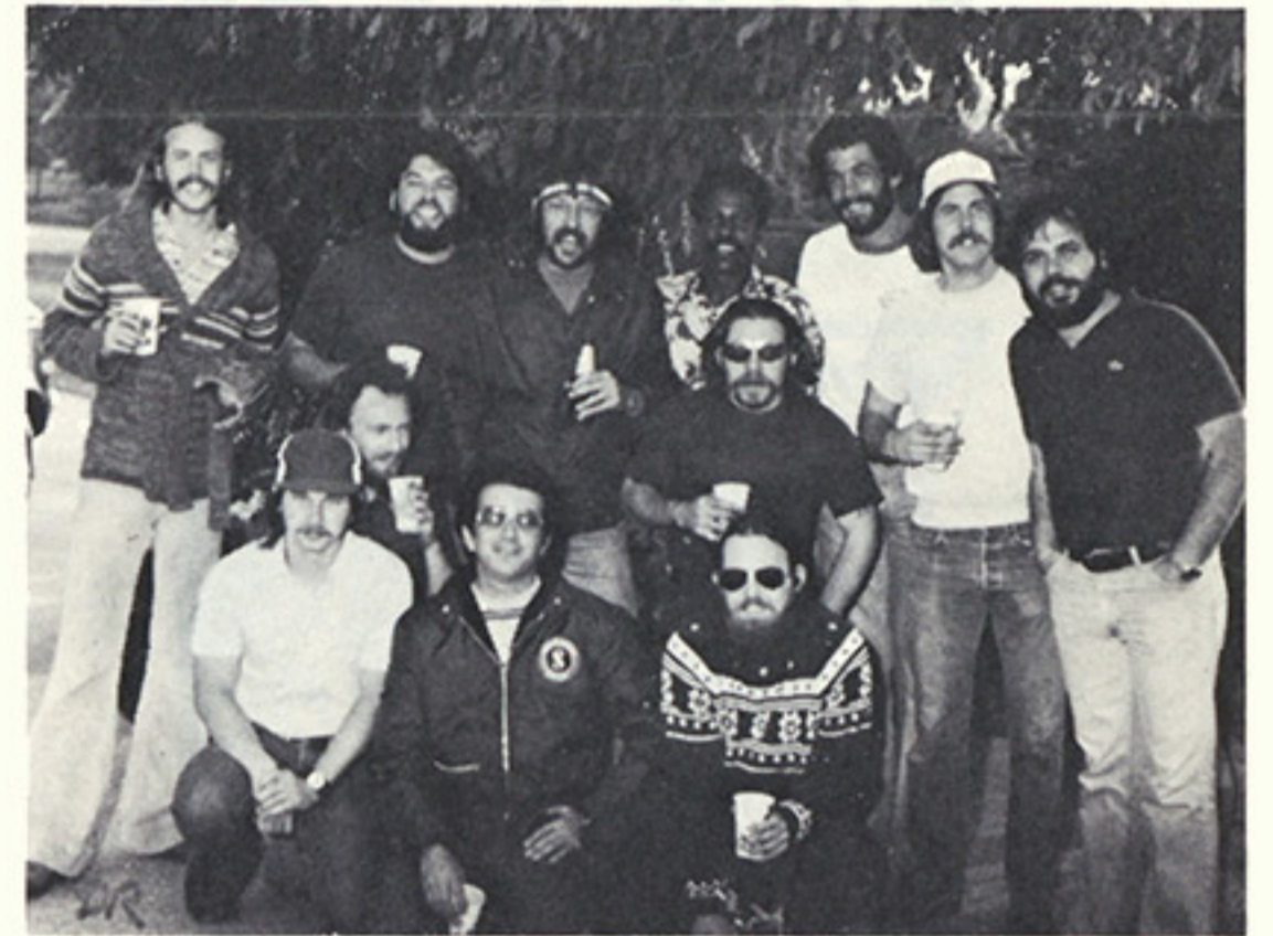
Atari Coin-Op Baseball Team

Atari is represented around the world in recreational sports. Pictured here is the Atari Coin-Op Baseball team at our headquarters in California, and the Socodimex/Atari-Europe Soccer team in France. Atari is also represented in Rugby, having several employees on the San Jose Seahawks amateur team that is presently on tour in Australia.