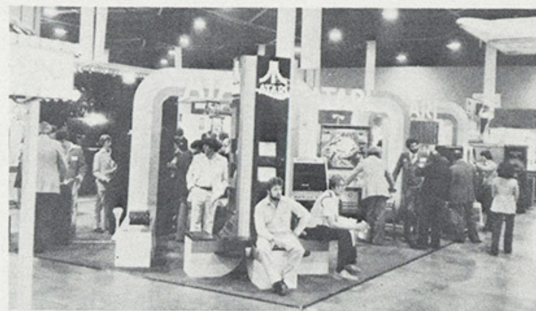
The Atari booth at IAAPA attracted park representatives.