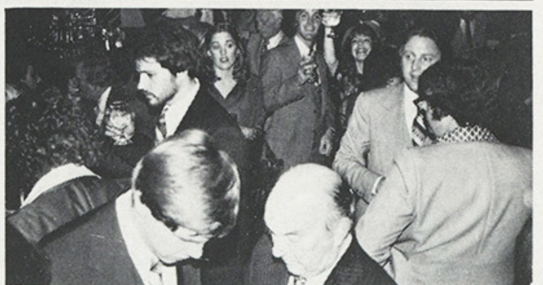
The crowd was festive at Atari's annual AMOA cocktail party honoring their distributors. FACES disco was the setting for an enjoyed evening of dancing, food, drink and socializing.