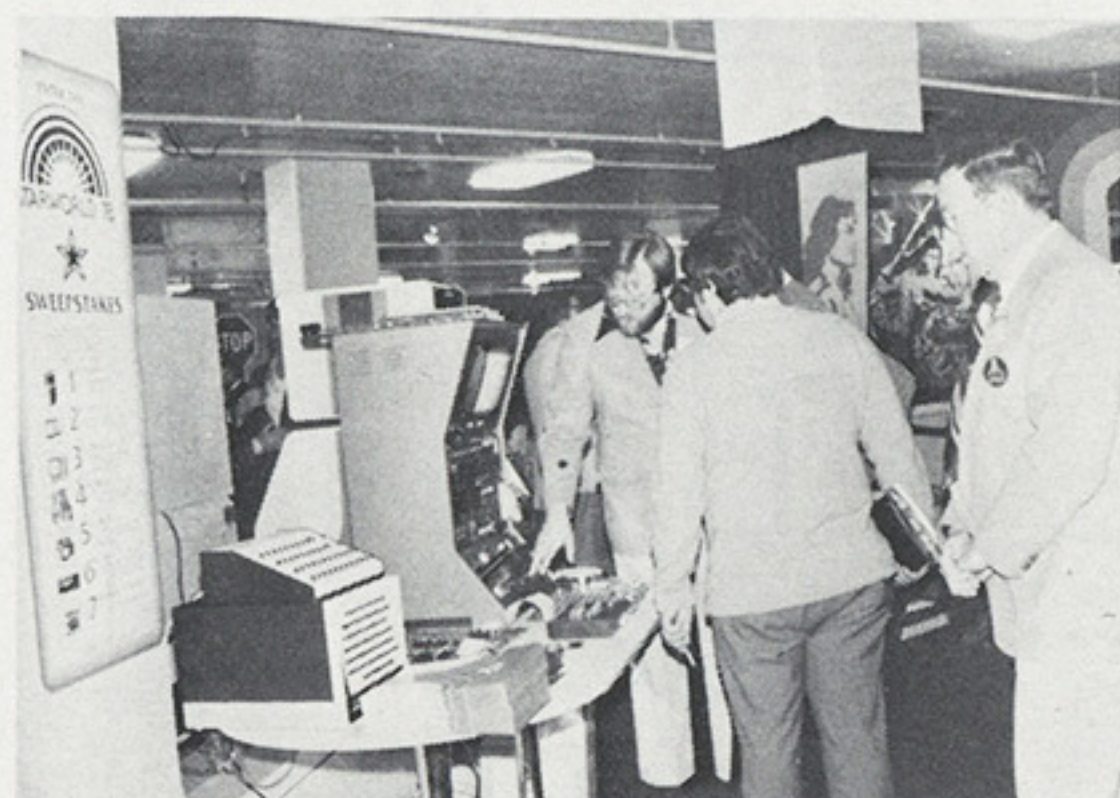
Service Representatives demonstrate Atari Test Fixtures.