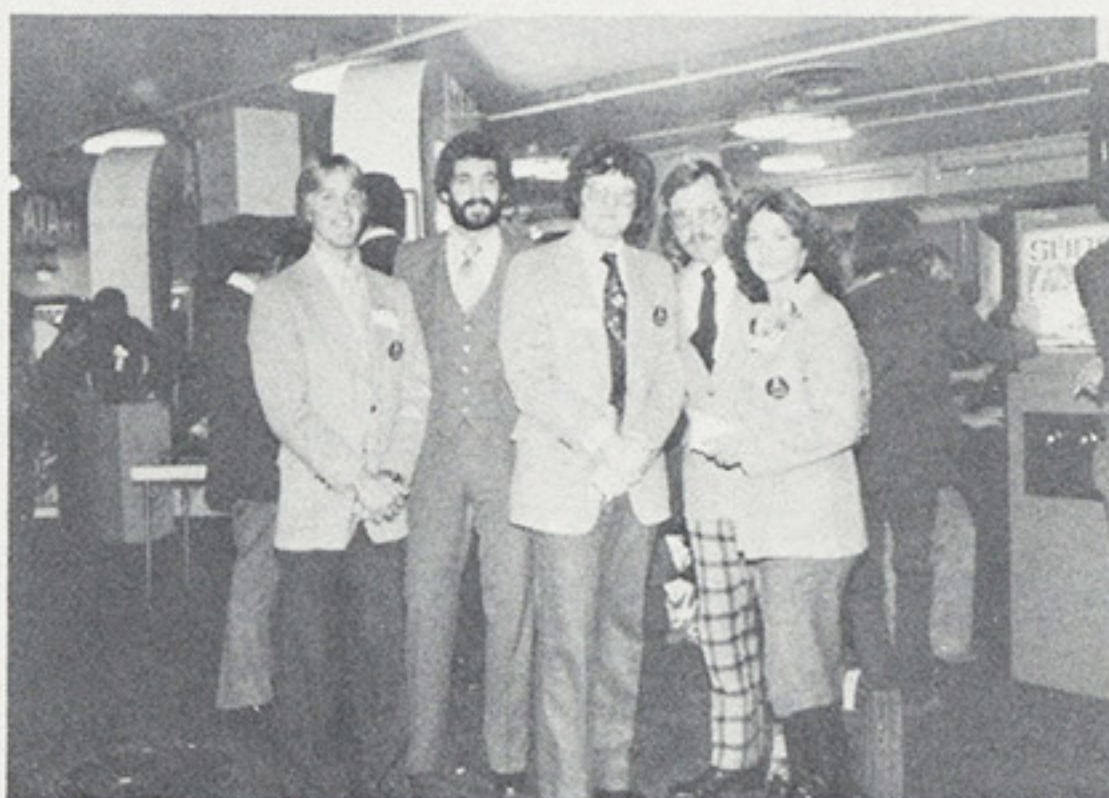
The Atari sales team gathers at booth.

Operators were able to see Atari's new line of products, many for the first time. By having these products on display, customers were invited to play and compare the games. Additionally, many key Atari personnel were available to give first-hand information to customers and to answer any specific inquiries.