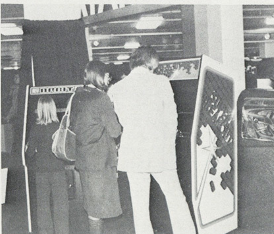
ORBIT™ and SUPER BREAKOUT™ attract enthusiastic players.