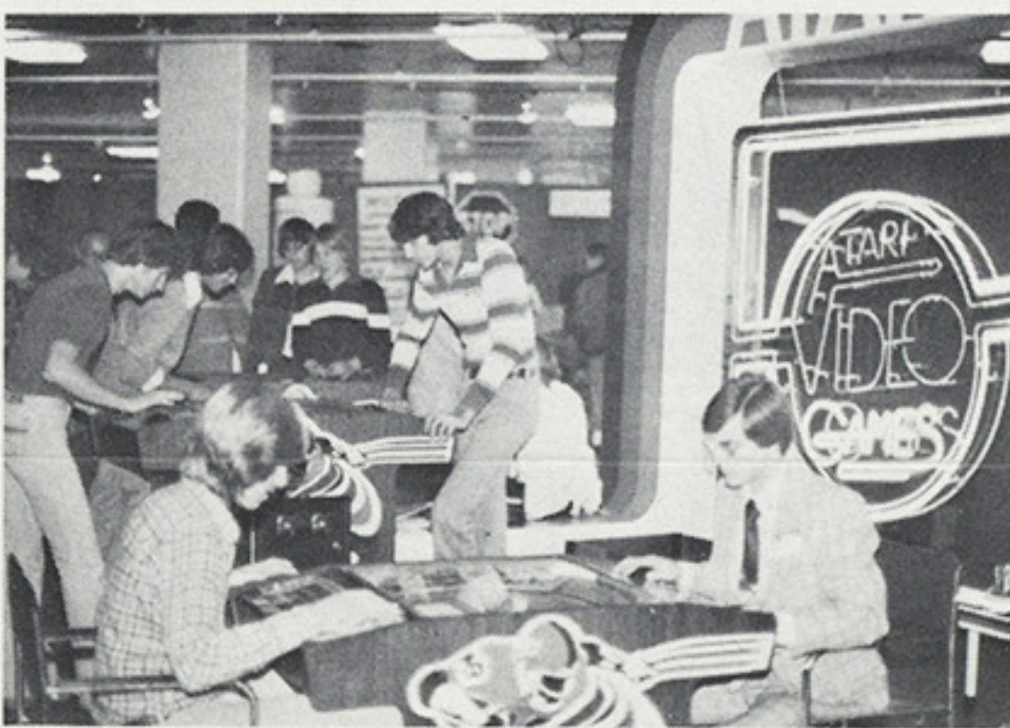
Crowds gathered to watch the ATARI FOOTBALL™ competition.