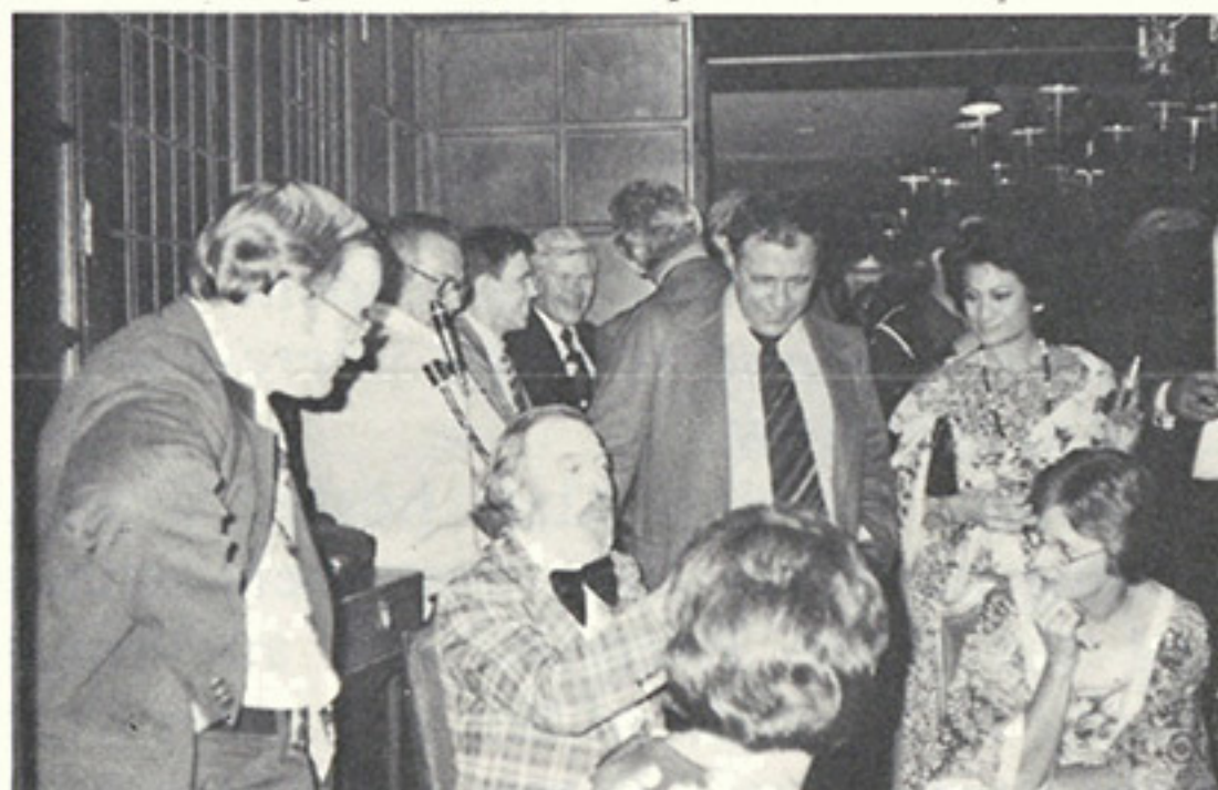
"Mr. Fingers" amazes all at the cocktail party.