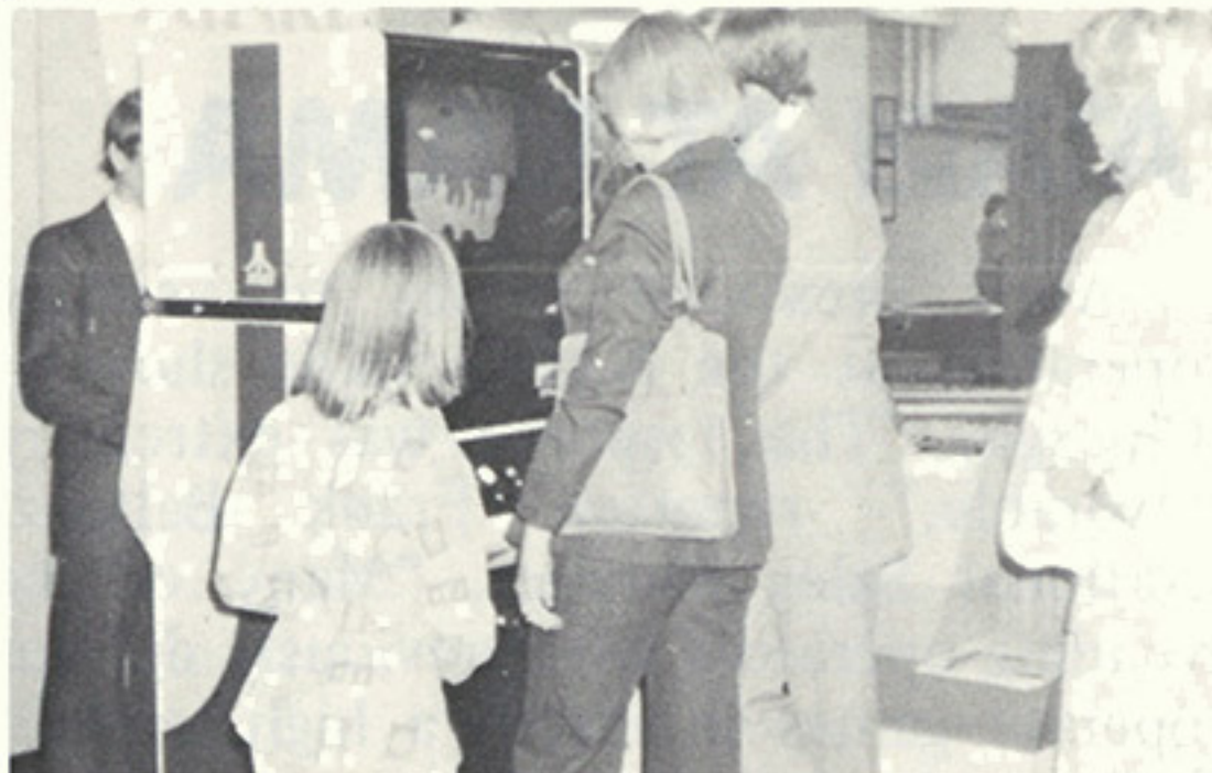
2 Game Module attracts interest at AMOA.