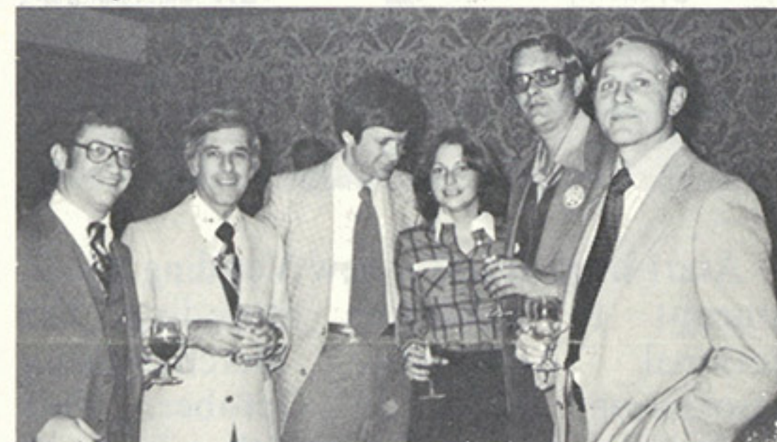
Atari customers enjoy food and wine at NAMA party.