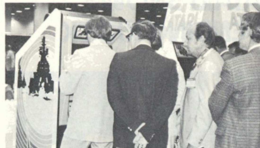
Operators and distributors compete on Destroyer™.