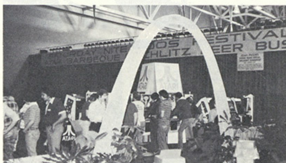
Atari Arcade at FOOSBALL Tourney.