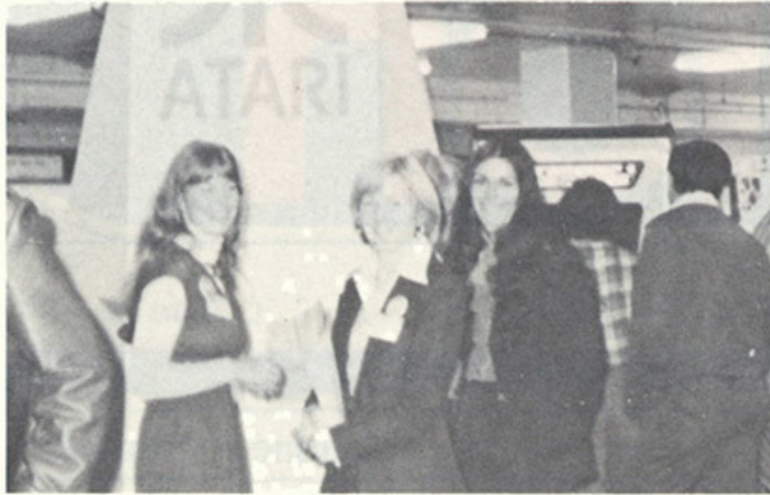
Atarians were on hand to greet customers at the booth.