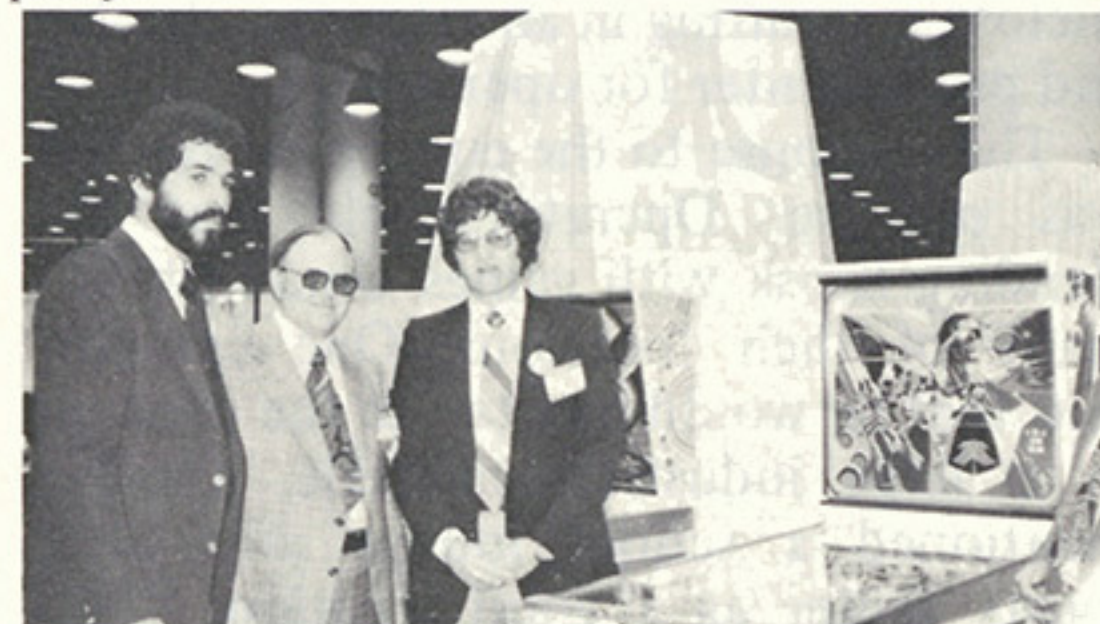
Atari introduces Airborne Avenger™