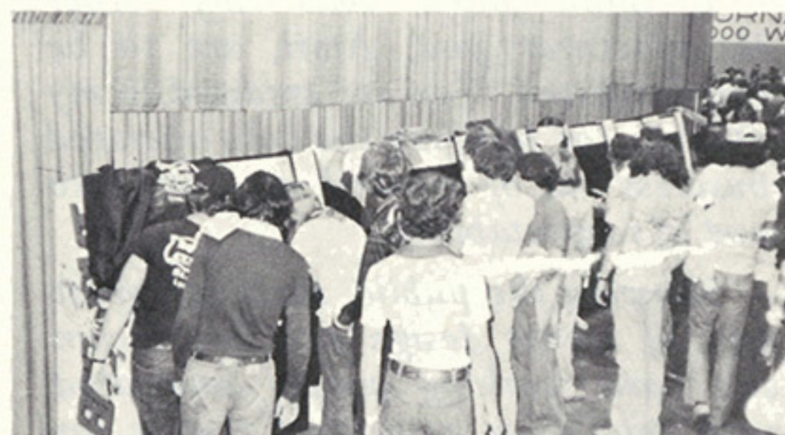
Breakout Tourney Challenge.