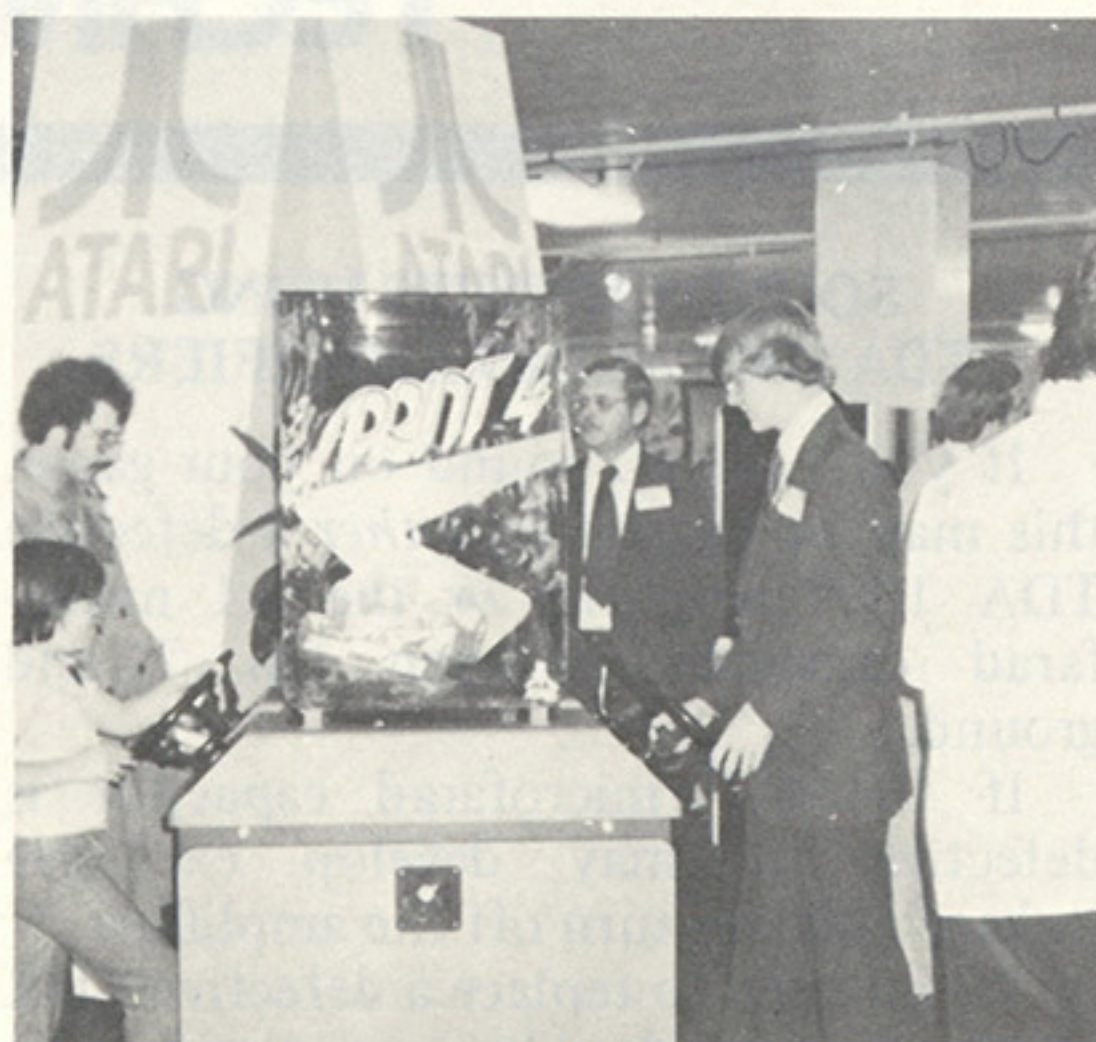
Canyon Bomber™ and Sprint 4™ were among the best games of the show.