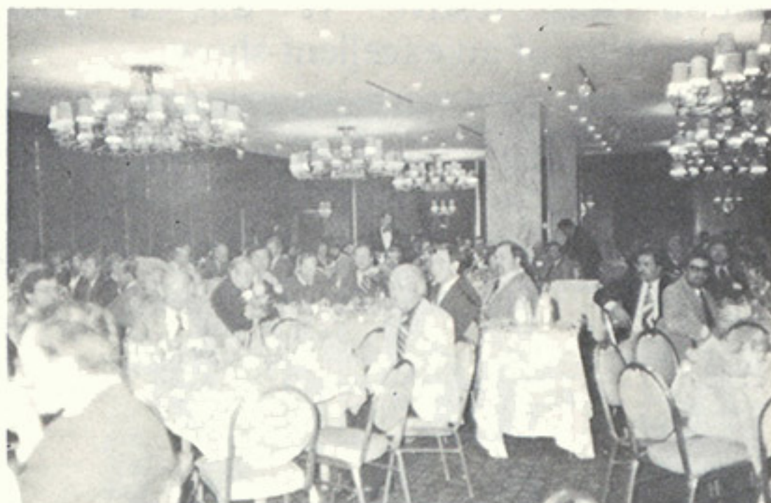
The distributor's breakfast.