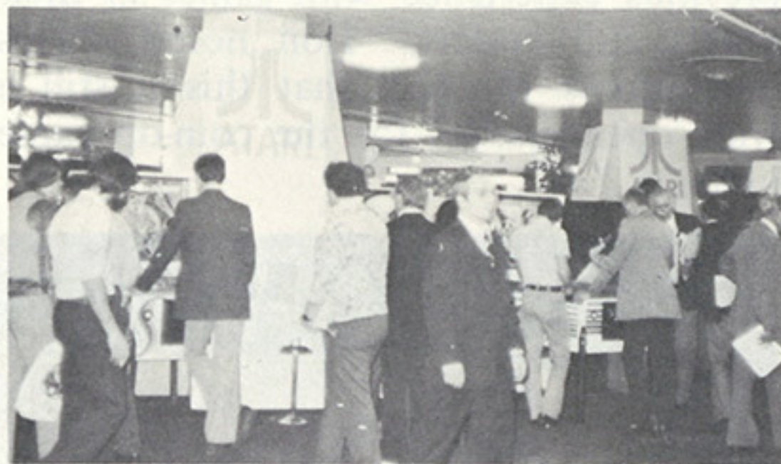
Atari pinballs attracted much interest.