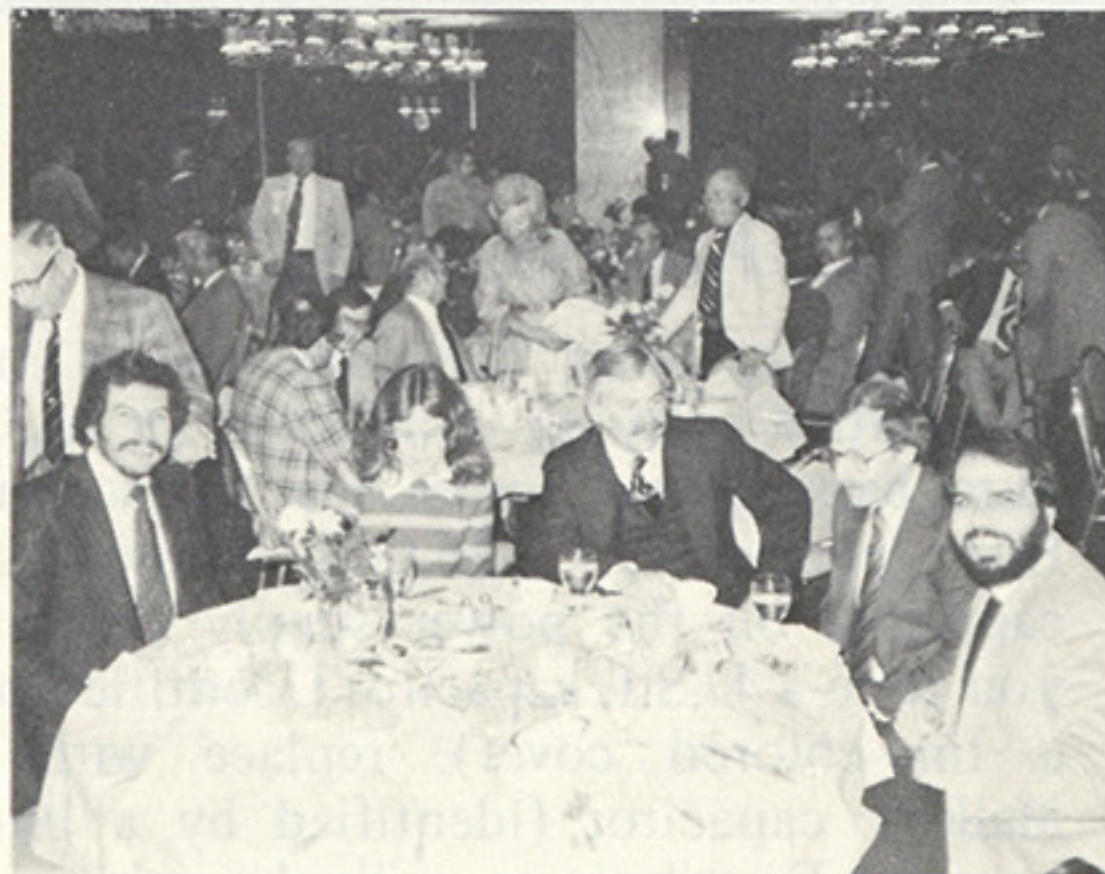
Distributors gather for Atari's breakfast meeting.