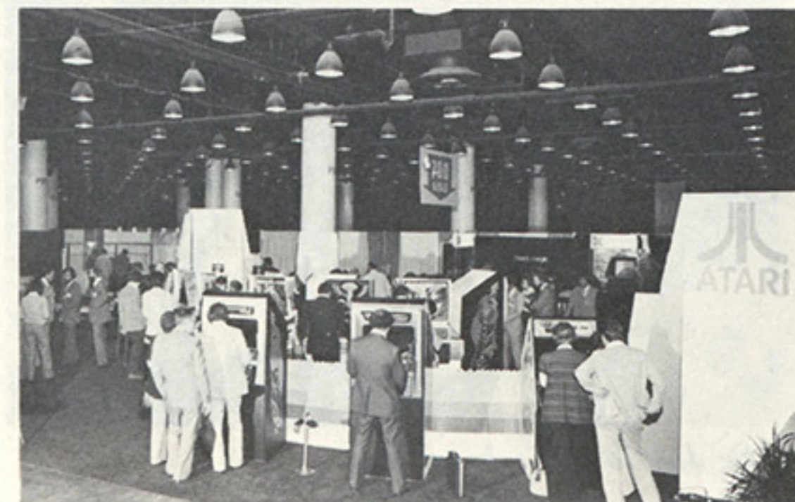
(More NAMA photos page 4.)

Friday evening Atari hosted a wine tasting party for their customers attending the show. Everyone had an opportunity to try eight of the best wines from California, Atari's home, and there were plenty of good appetizers to enjoy. The mood was festive. It was a good celebration of an excellent show.