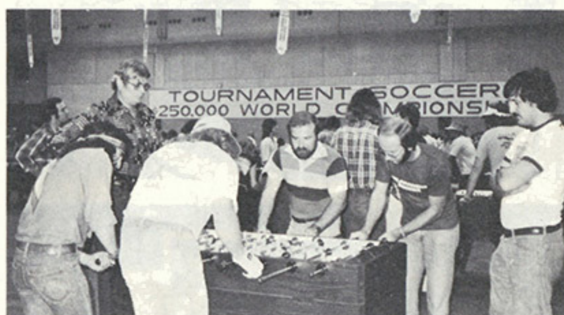
Atarians join in Tourney Soccer Festivities.